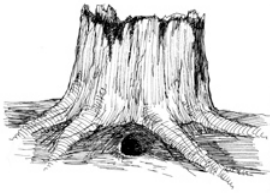
1 ½ inch hole chipmunk