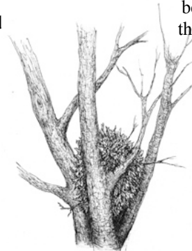
Squirrel Dray Made of leaves and sticks.

1. Give yourself a point for taking a nature hike. 2. Give yourself a point for each different type of home you find. Total possible 11 Total for you _____