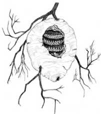
Hornet Nest Do not disturb

1. Give yourself a point for taking a nature hike. 2. Give yourself a point for each different type of home you find. Total possible 11 Total for you _____