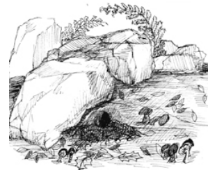
5-7 inch hole Woodchuck Dirt pushed outside of hole