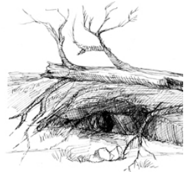
9-12 inch hole fox