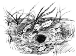
One inch hole Mouse