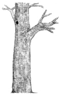
Woodpecker/Chickadee 1-2 inch hole If outside of hole is chewed to enlarge hole – red squirrel

Most holes are made by woodpeckers, and are later taken over by other animals. Larger holes develop if a branch breaks off a tree.