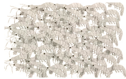
Zooplankton – millions in a school

There is no sea floor in the pelagic ocean.. The depth is up to 600 feet.