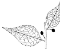
Hackberry Cork-like bark; Berries in mid summer; Leaves often have "bumps" on them and can be yellowish-green