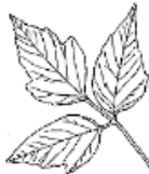
Box Elder 3-5 leaflets; has "helicopter" seeds