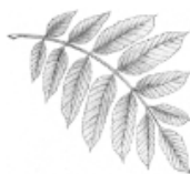
Butternut 11-17 leaflets; Similar to walnut; fruit is lemon- shaped