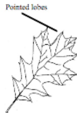
Red Oak Leaves turn red in the fall; has "alligator" bark.