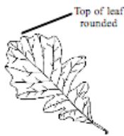
Bur Oak Leaves turn brown in fall