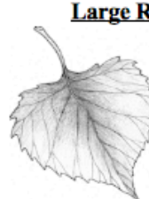
Cottonwood Older trees have large trunks; cotton-like seeds; makes a whispering sound in the wind.