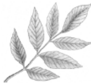
Green Ash 5-7 leaflets