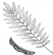
Honey Locust Bean-like seed pod; seedlings can be highly invasive