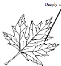
Silver Maple Leaves turn yellow in the fall