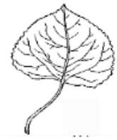
Quaking Aspen Dark brown twigs; Small round leaves; makes a whispering sound in the wind