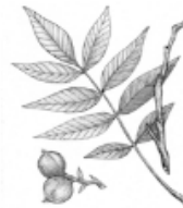
Smooth Bark Hickory Less than 10 leaflets; Dime-sized rounded nuts