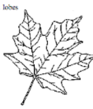
Sugar Maple Leaves turn orange in the fall