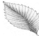
American Elm Leaves feel rough