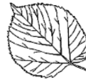
Basswood Often has multiple trunks