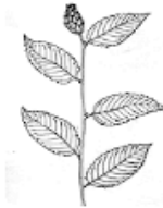
Ironwood Leaves feel fuzzy and soft; grows in the understory of the forest.