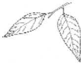
Black Cherry Black fruit in mid-summer; flakey bark on mature trees