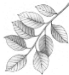
Buckthorn Has simple leaf; non-native; highly invasive; dark fruit