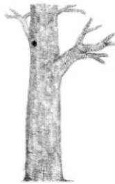
Woodpecker/Chickadee 1-2 inch hole If outside of hole is chewed to enlarge hole – red squirrel

Most holes are made by woodpeckers, and are later taken over by other animals. Larger holes develop if a branch breaks off a tree.