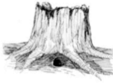
1 ½ inch hole chipmunk