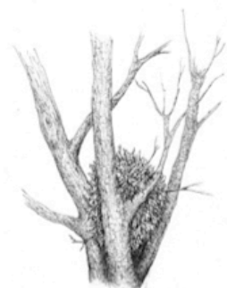
Squirrel Dray Made of leaves and sticks.

Give yourself a point for taking a nature hike. Give yourself a point for each different type of home you find. _____