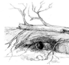
9-12 inch hole fox