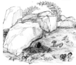
5-7 inch hole Woodchuck Dirt pushed outside of hole