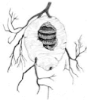
Hornet Nest Do not disturb