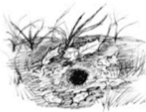
One inch hole Mouse